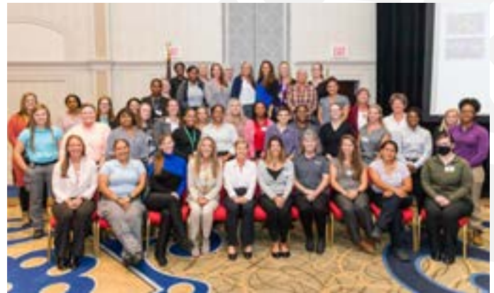
Virginia State Police participants at the Women in Law Enforcement Conference.